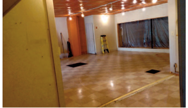
Store from side