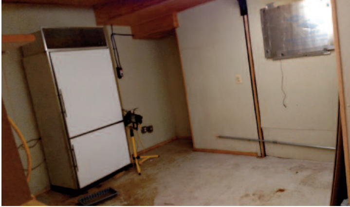
Back area of store