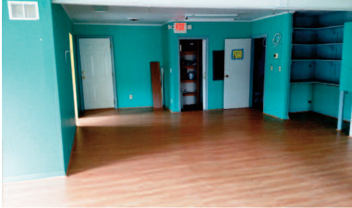
Interior Right Retail Unit